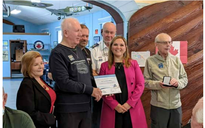
Lindsay Mathyssen, MP for London-Fanshawe presented the award.