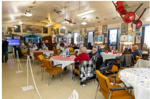
See more on page 3.