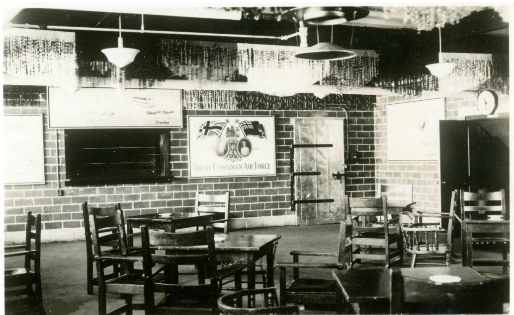
AIRMENS' CANTEEN, CAMP BORDEN, ONT.