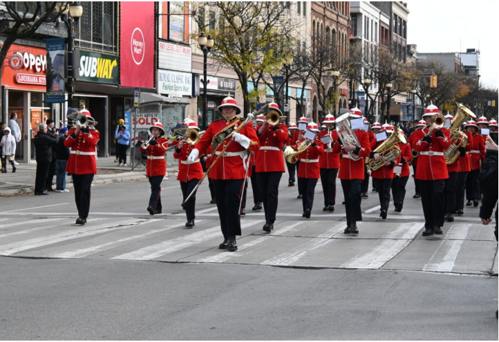
The Royal Hamilton Light Infantry band marching on King Street in the 2023 Garrison Parade

Always an uplifting event for participants and spectators alike, the parade featured the marching bands of the Royal Hamilton Light Infantry, the Argyll and Sutherland Highlanders and HMCS Star, as well as veterans and cadets ---- including the Royal Canadian Air Cadets who marched proudly.