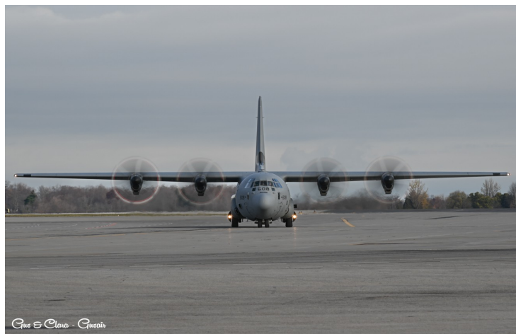
The Hercules arriving from 424 Squadron, Trenton