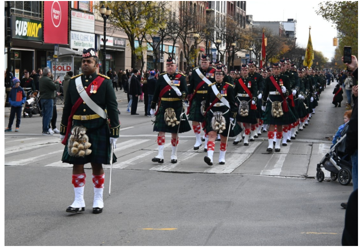
The Argyll and Sutherland Highlanders marching in Hamilton's Garrison Parade on Remembrance Day