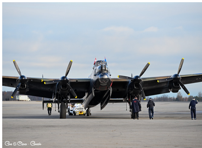
The CWHM Lancaster

The CWHM Lancaster made a majestic flypast during the ceremony and RCAF representation also included a Hercules crew from 424 Squadron at CFB Trenton.