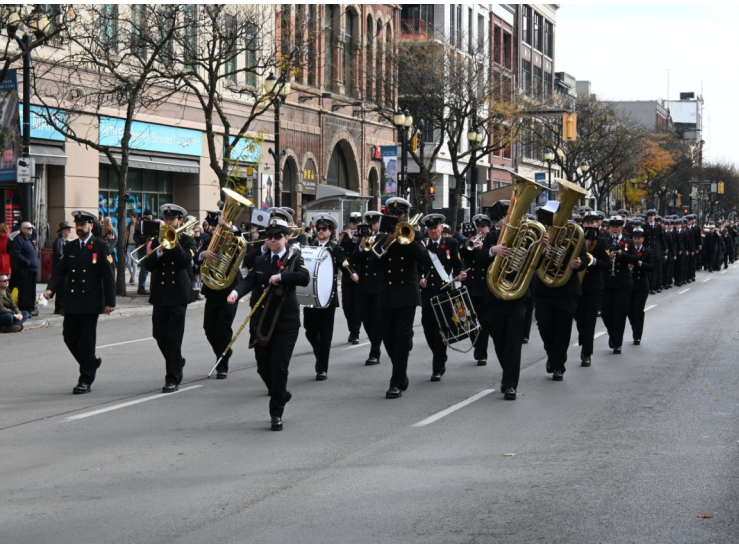
Hamilton's HMCS Star, led by the band, marching in the 2023 Garrison Parade