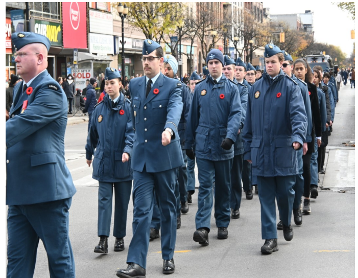
The Royal Canadian Air Cadets marching to the Armoury as the 2023 Garrison Parade concluded

In Toronto, events included the traditional ceremony at the Old City Hall featuring a flypast by three Harvards from the Canadian Harvard Aircraft Association based in Tillsonburg and a Hercules. The RCAF Association ceremony held at Mount Pleasant Cemetery, adjacent to the monument for LCol. Willam G. Barker, VC, was another highlight among the numerous activities in the area.