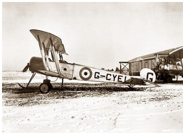
Avro 504D 'G-CYEI' started life in the Canadian Air Force on 27 October 1921.