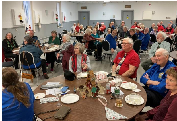
The fun-filled afternoon was enjoyed by all.

chair with yellow dot won the bird house. There were also elaborate displays of RCAF memorabilia that members brought in, including an original copy of the London, England, 'V-Day' newspaper from 8 May 1945. Along with the numerous model aircraft, there were copies of the 40 RCAF Centennial banners, and items of interest from when our members served in the RCAF/CF/CAF.