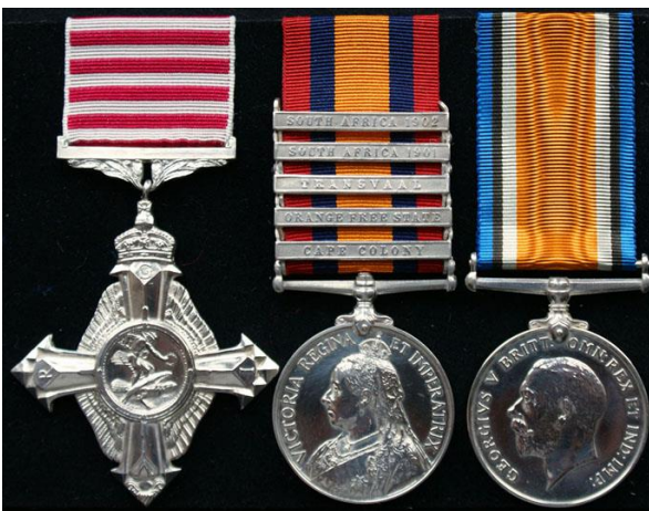
Tailyour's Medals - AFC, Queen's South Africa Medal with 4 Clasps, Great War Medal

There is no shortage of RCAF history in Simcoe County, of which Borden is the centerpiece. Many people do not realize that post the Great War, Borden was a very active Air Station. In fact, during 1921, 375 officers and 835 airmen completed training courses at the "School of Aviation" at Borden in the fledgling Canadian Air Force. There were 7,292 training flights and 313 communication flts, for a total of 2,847.45 hours, done in all types of weather.