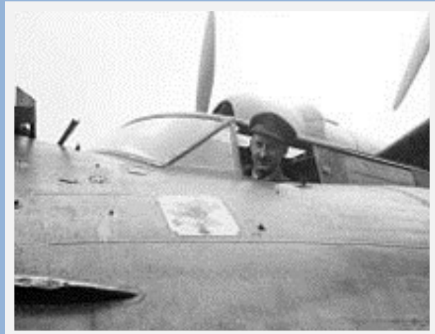
S/L Leonard Birchall aboard a Canso before being shot down & captured near Ceylon by the Japanese.

On June 10, 1940, Birchall was responsible for the capture of an Italian merchant ship, the Capo Nola , in the Gulf of Saint Lawrence, hours after Canada