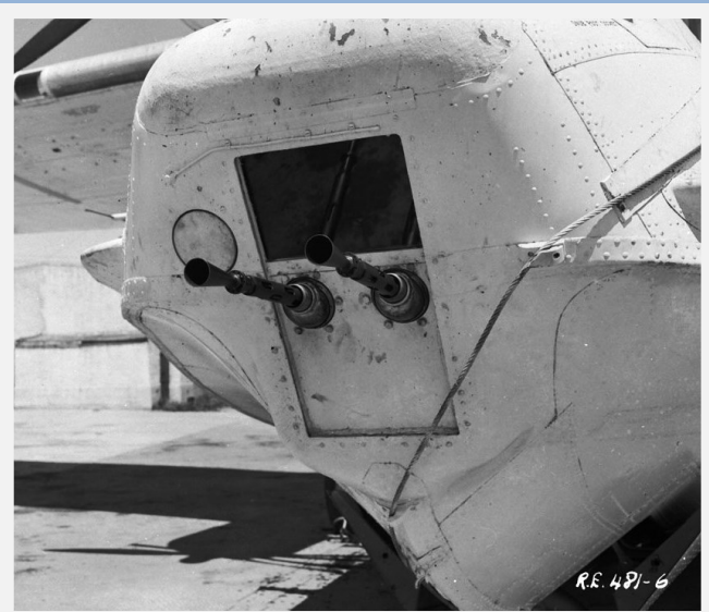
Nose Guns, Canadian Vickers PBV-1A Canso A

declared war on Italy. Birchall had been assigned to locate any Italian vessels still in Canadian waters. Finding the Capo Nola , Birchall had been informed of the declaration of war by radio and made a low pass over the freighter, as if making an attack. The panicked captain ran his vessel aground against a sandbank. Birchall then touched down nearby and waited until R.C.N. vessels reached the scene. The Capo Nola's crew were the first Italian prisoners taken by the Allies during the war.