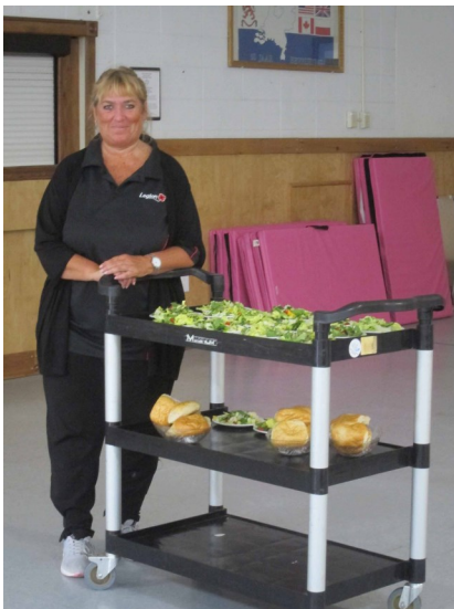
Let the meal begin!