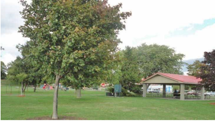
A portion of HH Knoll Lakeside Park, Port Colborne

434 Niagara Wing celebrated Canada Day with a booth in the HH Knoll Lakeview Park where celebrations are held annually for Canada Day. The park is 9 acres located in the City of Port Colborne. Established in 1922, it overlooks Sugarloaf Harbour and Gravelly Bay on Lake Erie. The Celebrations are an opportunity for 434 Niagara Wing to acquaint visitors with the RCAFA and also introduces people to 434 Niagara Wing and opportunities for them in our Wing.