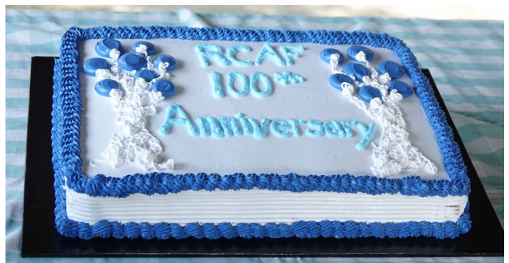
Birthday cake which also celebrates RCAF 100th anniversary