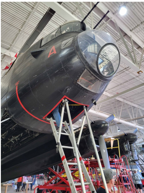
Sue climbing into Lancaster