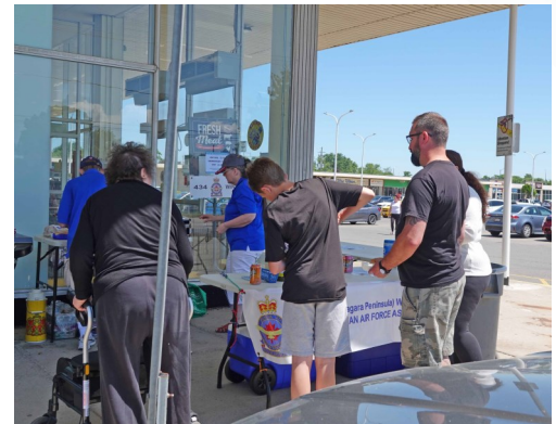
Get Your Hot Dogs and Hamburgers !