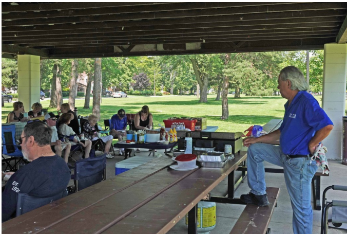
Rod with barbecue