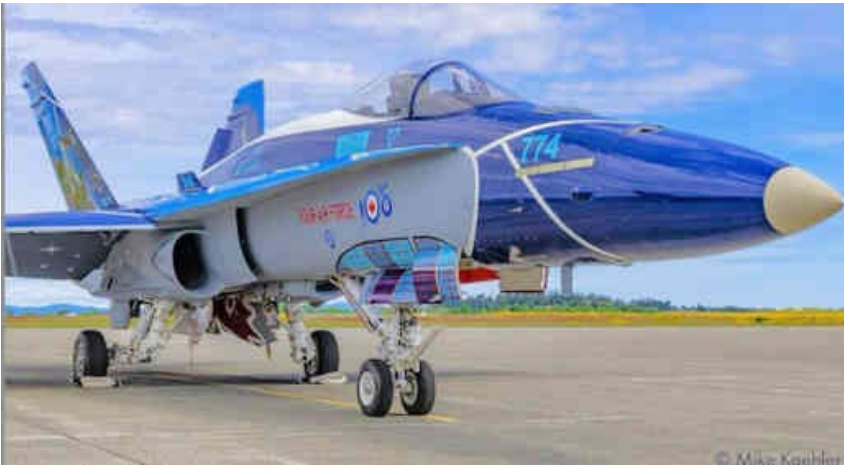
A 100th Anniversary CF-18