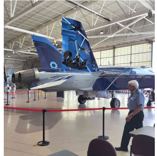
100th Anniversary CF-18 at CWH