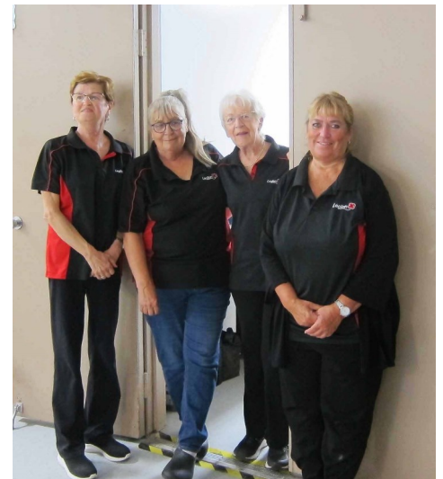
613 Royal Canadian Legion staff who served a wonderful meal