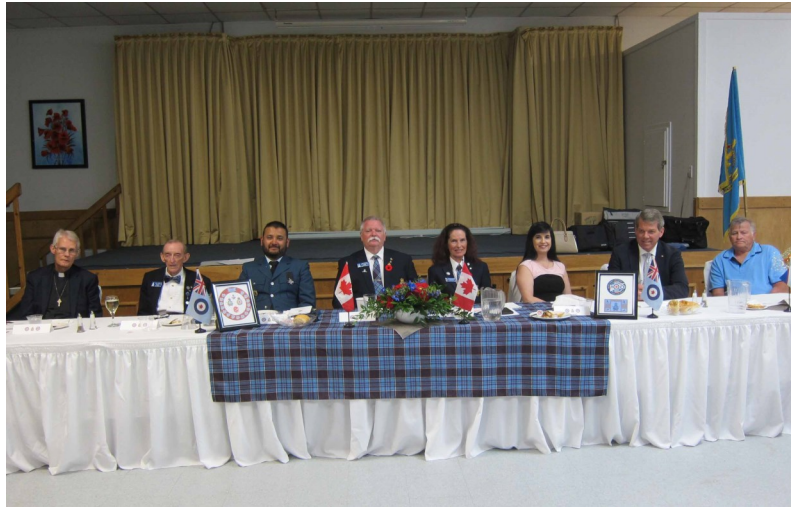
Our Head Table Guests

434 Niagara Wing's Annual Awards Luncheon was held on Saturday, June 22nd at Branch 613 Royal Canadian Legion in Fonthill, Ontario.