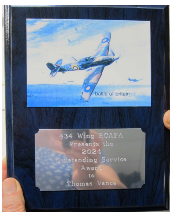
Outstanding Service Award