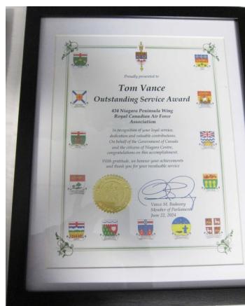
Certificate of Appreciation, Government of Canada