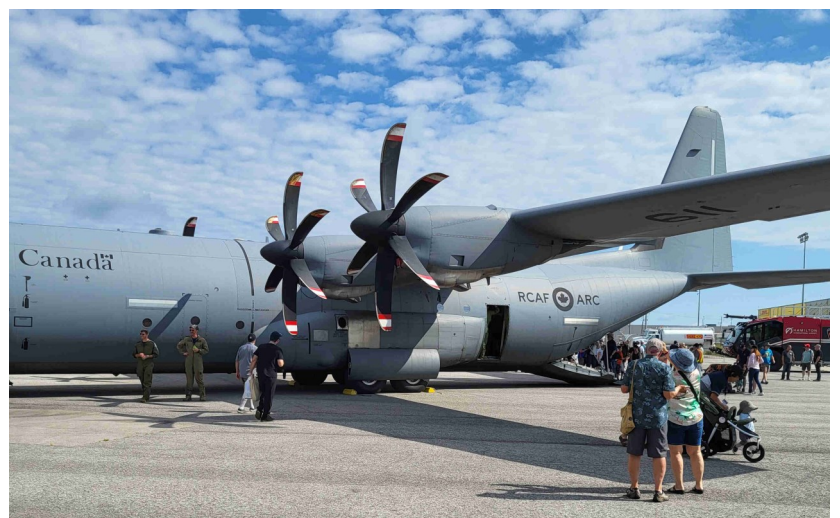
New, CC-130J Hercules