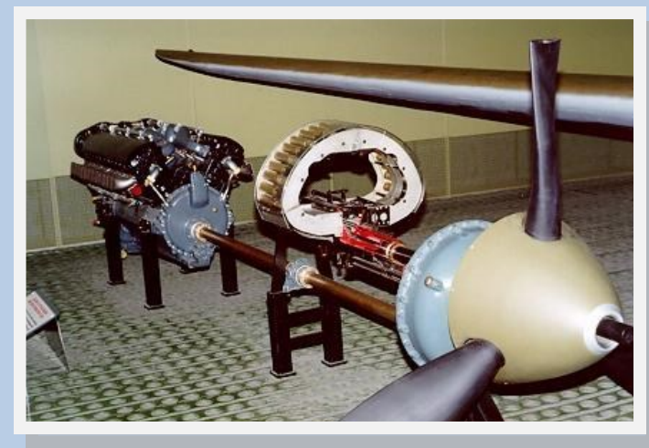
The T-9 cannon, produced by Oldsmobile, fired through the propeller hub.

The aircraft were flown from Nome, Alaska and across the Bering Sea to the Soviet Union. They were flown in groups of six or more, escorted by a North American B-25 or other medium bomber with more sophisticated avionics than those in the P-39, hopping from base to base across Siberia