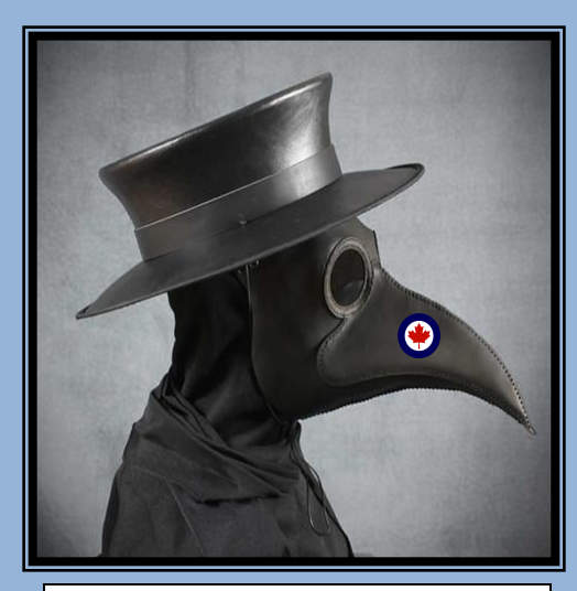
Dress for future Wing meetings. Specially ordered through Nick.