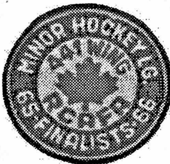
18 THE HOCKEY CREST