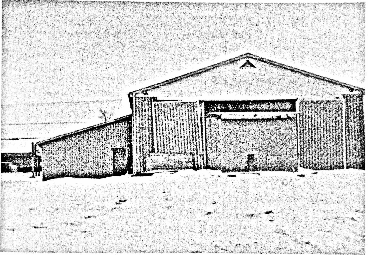
27 RCAF BUILDING (BACK VIEW)