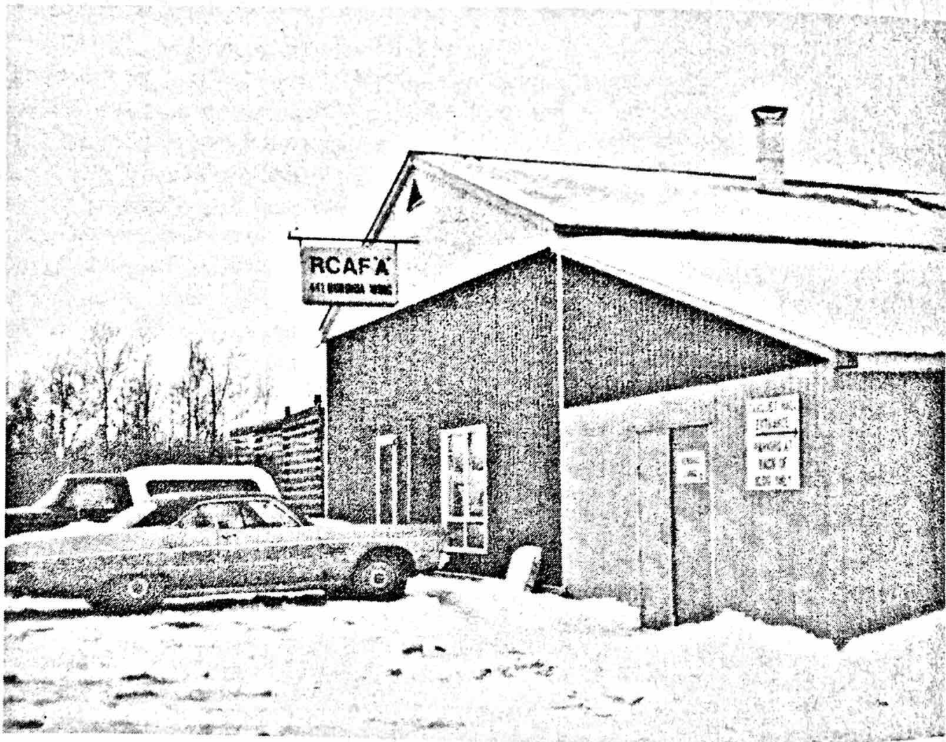
26 RCAF BUILDING (FRONT VIEW)