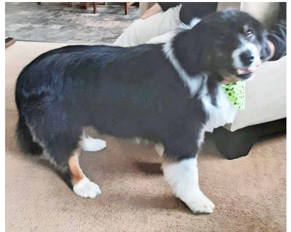
Timber, 434 Niagara's Mascot, was also present