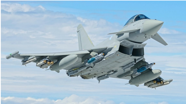
The Eurofighter Typhoon

The Typhoon is an advanced swing-role fighter aircraft that has simultaneously deployable air-to-air and air-to-surface weapons capabilities. Currently, the model is in service in nine countries: the United Kingdom, Germany, Italy, Spain, Austria, Saudi Arabia, Oman, Kuwait, and Qatar, but not in Canada.