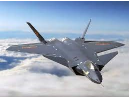
Chinese J-20 Stealth Fighter

At the Zapad 2021 military exercises , held in China's northwestern Ningxia Hui Autonomous Region, which concluded on August 13th, Chinese and Russian forces, 10,000 strong, demonstrated unprecedented levels of interoperability using a joint command and control system. A highlight of the exercises which signified their importance was China's deployment of J-20 stealth fighters, which marked the first time they were deployed alongside foreign forces.