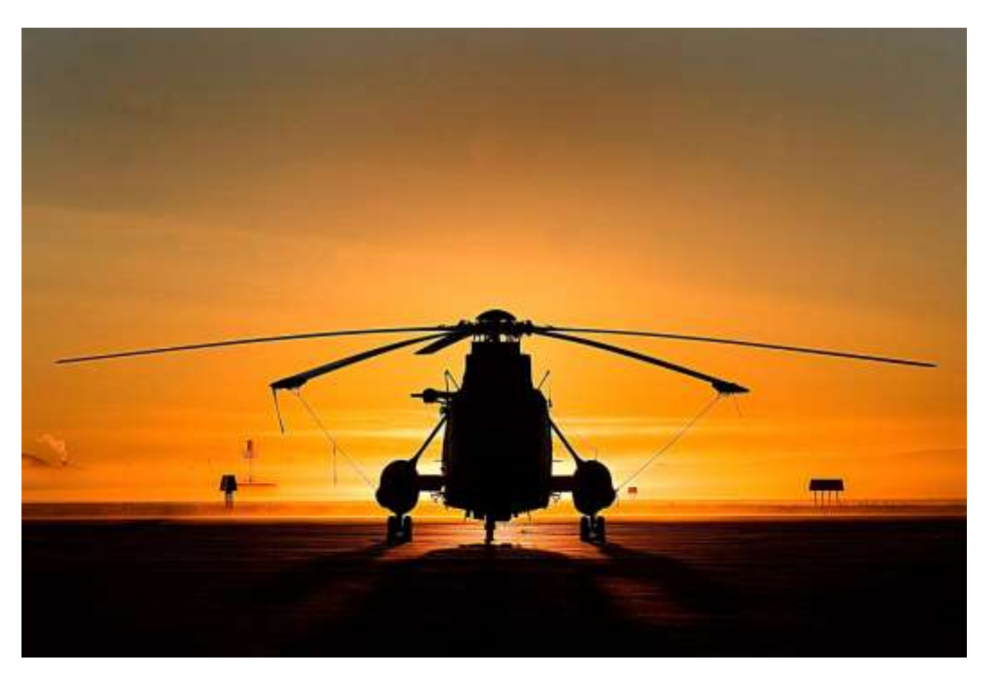
Sea King at Sunset