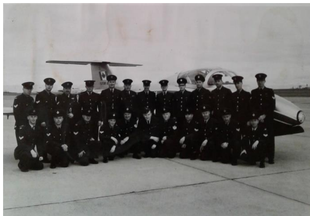
The Centennaires 'Maintenance Team' poses in front of one of the Tutors.

their distinctive gold paint scheme and flying the F-86 Sabre jet during the 1960's. It had been disbanded due to cuts in the defence budget.