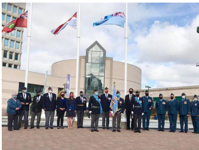
Members of 441 (Huronion) Wing and local dignitaries at the Battle of Britain Flag Raising