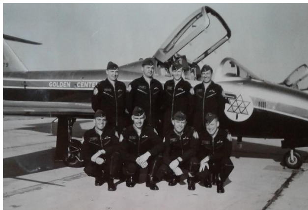
The aerobatic display pilots who flew the Golden Centennaire Tutors in 1967.