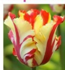
RESCUE (Flying Parrot)