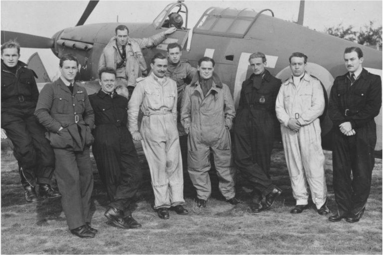
The famed No. 242 “Canadian” Squadron, pictured, was a Royal Air Force squadron that – at least initially – included a large number of Canadians. S/L Douglas Bader (centre) was its Commanding Officer (CO)

were scattered among a dozen RAF Squadrons. Also of significance, another 200 RCAF airmen served in Bomber and Coastal commands during the battle.