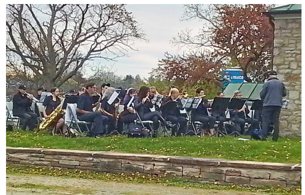
Niagara Falls Concert Band