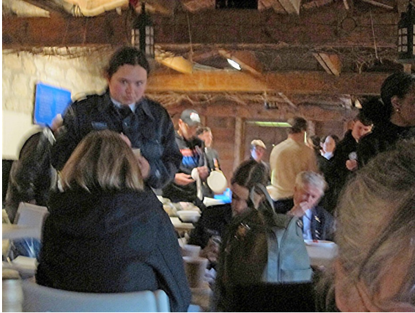
Attendees Inside Historic Navy Hall