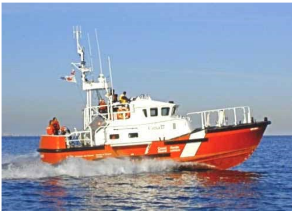
Canadian Coast Guard Ship Cape Mercy