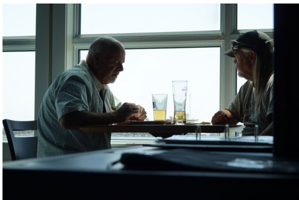
When the glasses are empty the party winds down