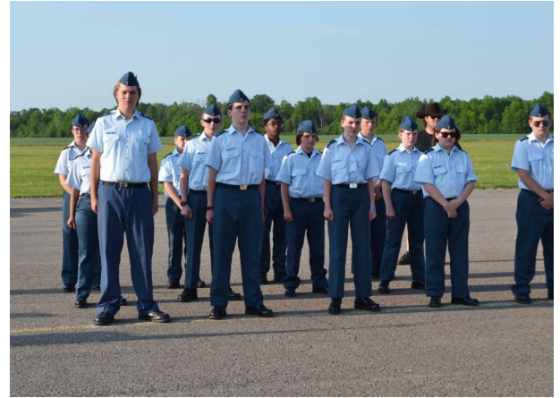
Air Cadets practising drills for upcoming Annual Inspection