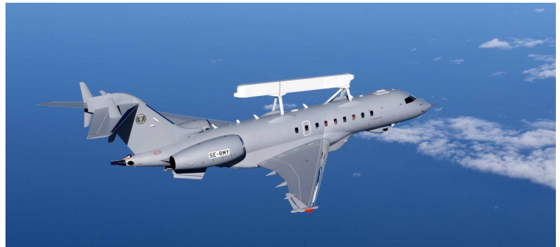
Bombardier Defense Global 6000

Bombardier Defense has handed over the sixth Global 6000 to Saab, which will configure the business jet into a GlobalEye airborne early warning and control platform for the Swedish Air Force. The latest GlobalEye integration into the Swedish Air Force exhibits Bombardier's specialty in transforming platforms to match military customers' unique requirements.