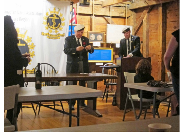
Calling out Winning Tickets

It was a meaningful service and it gave 434 Wing members an opportunity to meet with fellow members of the Royal Canadian Naval Association Niagara Region.