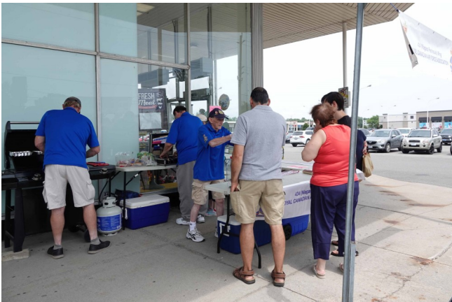
Customers making purchases