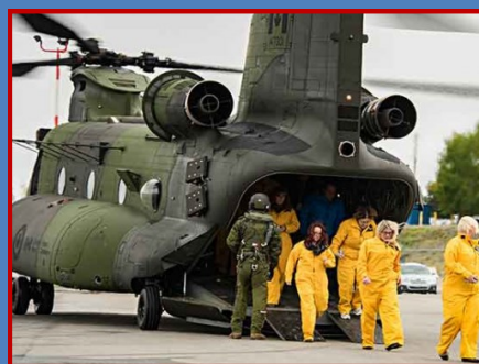
Fleet makes parts for the Boeing Chinook